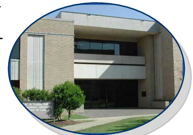
SU Law Center