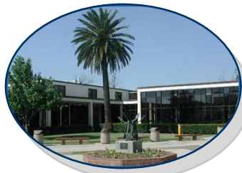
SU Baton Rouge Campus