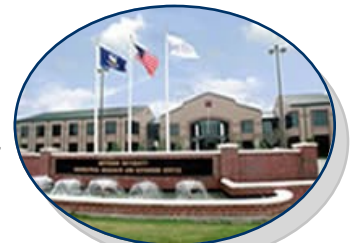
SU Ag Center