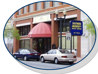
SU Shreveport Campus