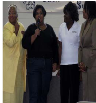
Partner With Us!