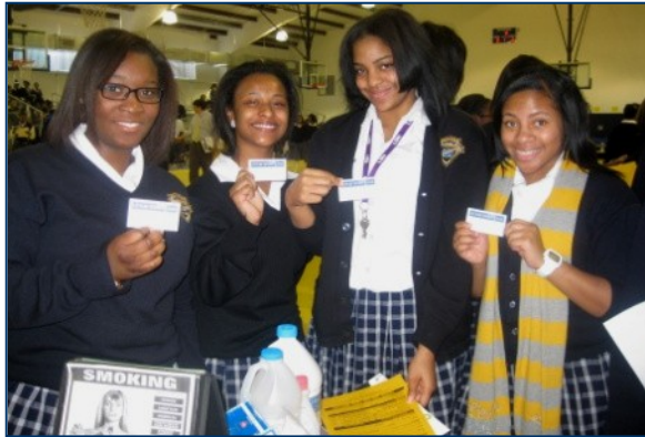
Students vow to live tobacco-free lives by signing pledge cards at CoC Network's booth display at St. Mary Academy High School.