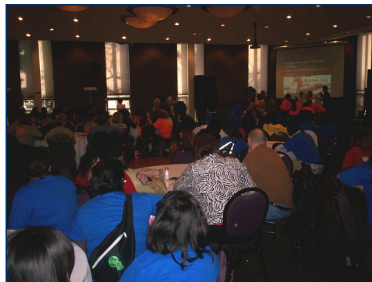
Participants take part in general session activity during keynote speaker address.