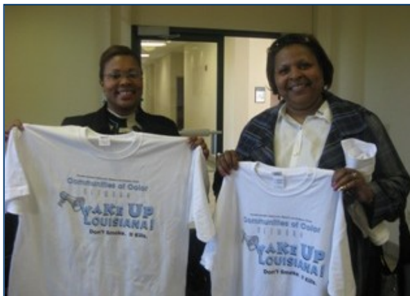
Employees at Southern University Ag Center in Baton Rouge receive CoC Network t-shirts after signing pledge cards to live tobacco-free.